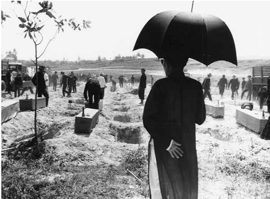
Interment for 300 unidentified victims of the communist occupation of Hue in 1968.

Throughout the Vietnam War the United States and the GVN forced the relocation of civilians and designated the cleared areas free-fire zones (after December 1965, specified strike zones), particularly between 1966 and 1970. The purpose of these relocations was three-fold: “(1) deny the enemy manpower, food and revenue; (2) to clear the battlefield of innocent civilians, establish SSZs [specified strike zones] and make possible the freer use of