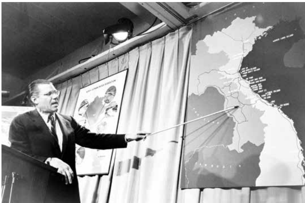
Secretary of Defense Robert McNamara pointing to a map of Vietnam at a press conference. Marion Trikosko April 26, 1965. U.S. News & World Report Magazine Photograph Collection, Library of Congress.

Even if the United States had pacified South Vietnam and that government had the support of its people, the South still faced an existential threat from North. The United States had invested considerable resources in creating a South Vietnamese military that was largely a mirror image of the U.S. military. During the 1972 North Vietnamese invasion, the ARVN held its own in no small part because of American airpower that the North could not counter. Absent this airpower edge and other critical U.S. capabilities, the South fell to the North in 1975. 226