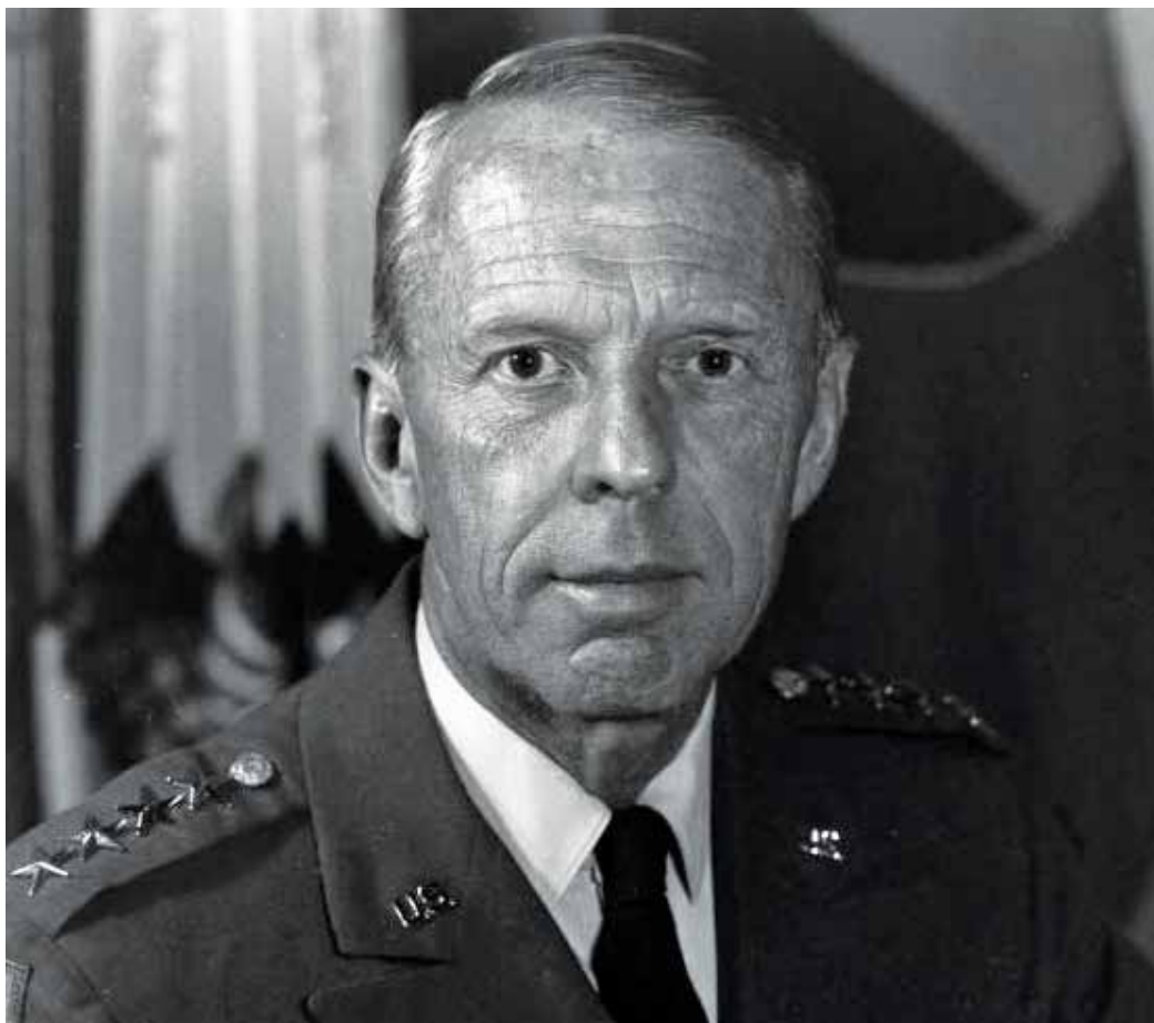
General William DePuy.

General Donn Starry, DePuy's eventual successor as TRADOC commander and a key figure in developing the Army's new AirLand Battle doctrine, was equally clear: "After getting out of Vietnam, the Army looked around and realized it should not try to fight that kind of war again elsewhere." 232 He also believed the Army should avoid its tendency to dwell on understanding the "last war [Vietnam]" and "to look ahead, not back." 233 This view prevailed, and as the 1980 BDM report presciently noted, "It is doubtful if the US has yet learned how to defeat—in a reasonable time and an acceptable cost—a well-organized and led 'People's War': the institutional knowledge gained in Indochina have been discarded or degraded, as have been the interest and incentives." 234 The 1976 FM 100-5: Operations that was the Army's first doctrinal expression of its post-Vietnam direction returned to the "lesser included"