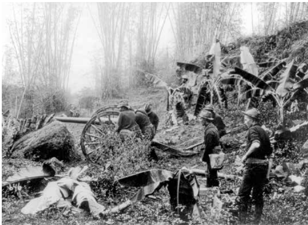
U.S. soldiers in Manila during the Philippine Insurrection, 1899. The gun is a 3.2-inch gun, M1897.

In May 1900, Major General Arthur MacArthur replaced Otis as commander of the Philippine Division. MacArthur dramatically shifted the emphasis from civic action to coercion. He also implemented the Civil War-era General Orders 100, which authorized the use of harsh measures by U.S. forces to quell the insurgency, and aggressively went after the guerrilla infrastructure. Following President McKinley's reelection, MacArthur also "increasingly turned to counterterrorism, thus offering a clear and very unpleasant alternative to those who continued armed resistance." 74