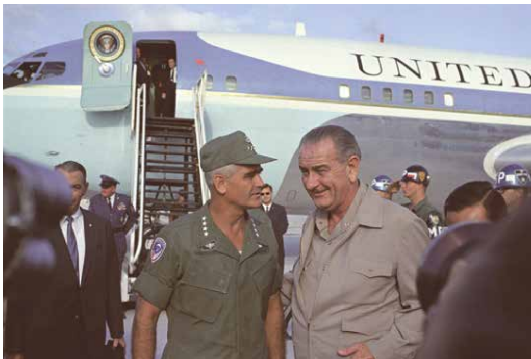
President Johnson and General Westmoreland in Vietnam a month before the Tet Offensive.

Not surprisingly, advisor duty, previously sought out as the only way to get combat experience in a peacetime Army, became less desirable as the best officers sought duty in combat units, knowing these jobs were career-enhancing. 164 Advisors also had little preparation for the “acute culture shock from being dropped into a completely alien environment,” a situation not helped by their preparation, because they had only cursory Vietnamese language and culture training from the Military Assistance Training and Advisory course at Fort Bragg. 165