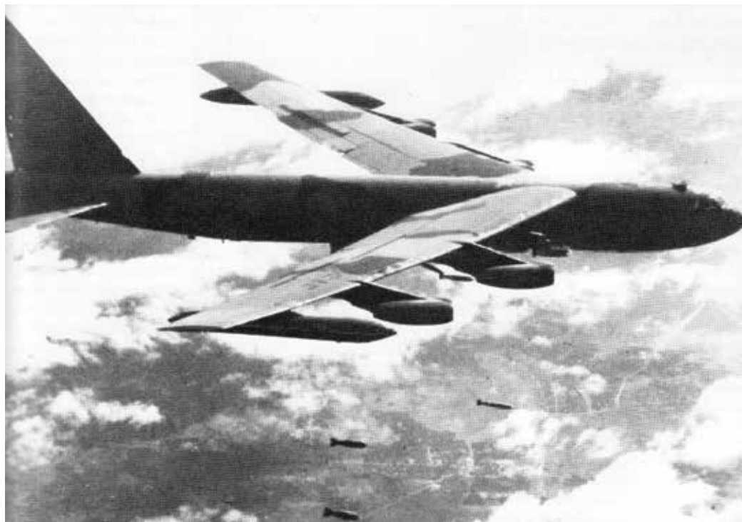
B-52s bombing over Vietnam.