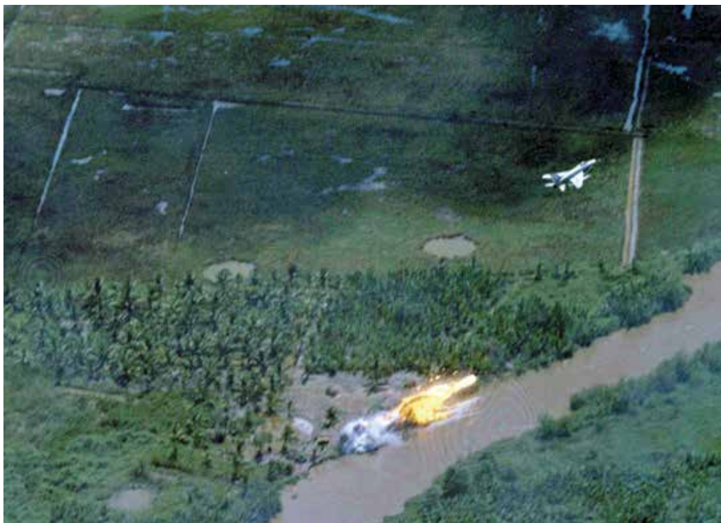
A USAF F-100 of the 90 th Tactical Fighter Squadron leaves the target area after dropping napalm on a suspected Viet Cong target in South Vietnam, March 1966.

Israeli Major General Moyshe Dayan provided an insightful appreciation of the American way of war in Vietnam: