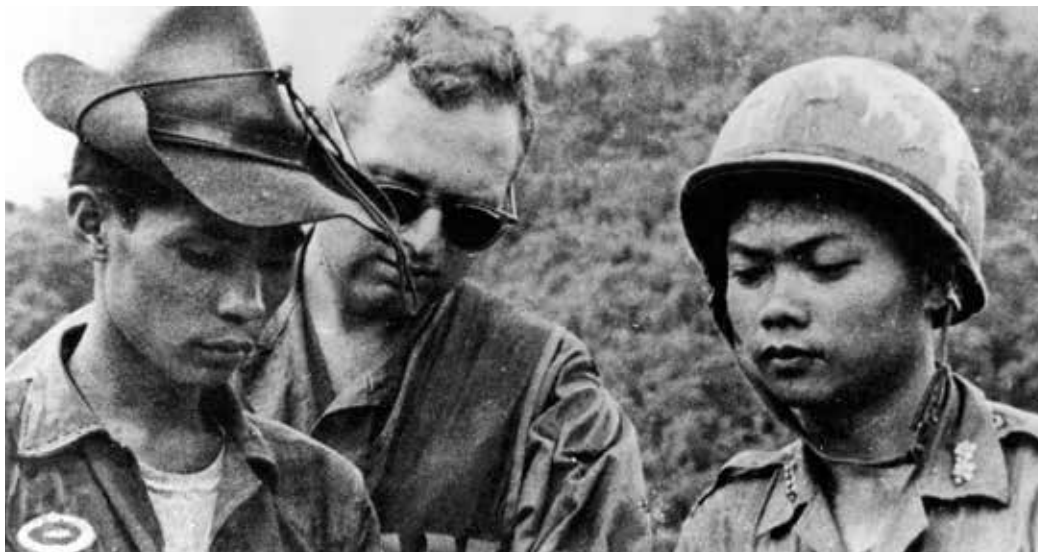
Army of the Republic of Vietnam soldiers and an American advisor in Vietnam.

In the early 1960s, Army doctrine reflected a conventional view about irregular warfare and counterinsurgency that was consistent with how it had viewed these types of operations since the Indian Wars. The May 1961 version of FM 31-15, Operations Against Irregular Forces , discussed the need for civil-military cooperation, intelligence, propaganda, and civic action, but it was clearly focused on the importance of dealing with the adversary: “The ultimate objective of operations against an irregular force is to eliminate the irregular force and prevent its resurgence.” 138 The manual also warned that the initial “force assigned to combat an irregular force must be adequate to complete their elimination.” 139