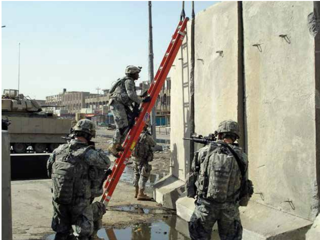
Emplacing T-walls in Baghdad during the 2008 Battle of Sadr City.

These walls were not without controversy. Some compared them to what the Israelis were doing; others charged they “were dividing neighbor from neighbor and choking off normal communications.” 284 U.S. and Iraqi forces also created fortified combat outposts and joint security stations throughout key city areas. Active patrolling further enhanced security and kept insurgents and death squads moving. Insurgent communications enabled U.S. forces to monitor and frequently intercept them. 285