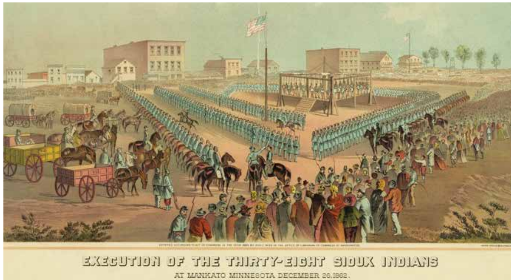
An engraving by W.H. Childs depicting the scene of the mass execution of 38 Dakota Indians on December 26, 1862. Library of Congress.

The majority of the surviving Dakota were exiled from Minnesota. But the Dakota raids continued, and in July 1863 the Minnesota state adjutant-general authorized bounties for Dakota scalps. Chief Little Crow was killed and scalped by settlers. Two other Dakota chiefs, Medicine Bottle and Sakpe (Shakopee), were kidnapped on the Canadian border in January 1864, brought to Fort Snelling, Minnesota, and hanged. 46 Some 1,700 other Dakota were moved to camps near Fort Snelling, and the tribe was eventually relocated to Crow Creek Reservation in South Dakota following the abrogation or revocation of treaties between the U.S. government and the Santee Dakota.